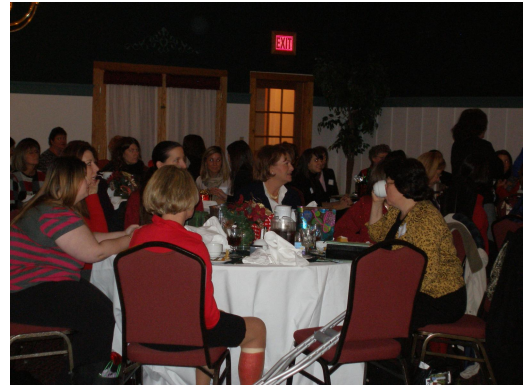
Women in Business Annual Holiday Luncheon at Shawnee Inn